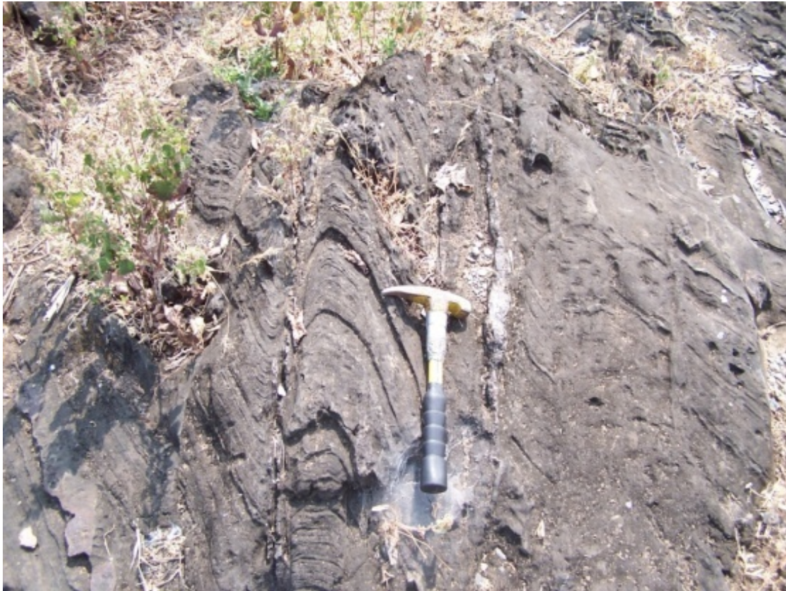
F2 folds in carbonaceous phyllite showing remobilisation of oxidised sulphides into vertically aligned S2 cleavage